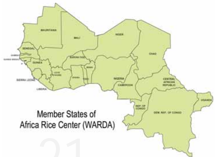
Member States of Africa Rice Center (WARDA)

For the first time , representatives of several stakeholders groups were invited as observers to the meetings held as part of the Council of Ministers session: farmers’ organizations, CTA, CGIAR Alliance, UEMOA, CMA/AOC.