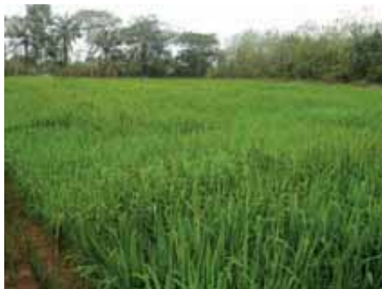
Fourth-generation progeny of O. glaberrima (AC103549) x TGS 25 showing wide variation in growth habit and maturity

proved successful in on-farm trials, as they have inherited earliness, tillering ability, large, long and slender grains, and stem-borer resistance from the O. barthii parent, which have helped increase yield and grain-weight over the O. sativa parent. By 2010, over 1300 lines possessing these attributes had been developed for multi-location evalu-