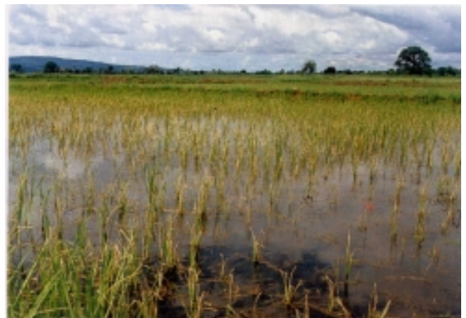
A rice field devastated by RYMV, Karfiguela, Burkina Faso, August 1990

that affected 50,000 ha of the Office du Niger (Mali) in the early 1990s prayed for deliverance from the curse of the disease! However, RYMV is unpredictable in its appearance—for example, the irrigated rice scheme at Karfiguela, near Banfora, Burkina Faso, suffered heavy symptoms in 1990, and yield losses of between 0.4 and 1.6 tonnes per hectare were recorded, but by 1993 the disease