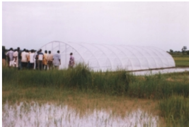
Inauguration of the screen house constructed in Mali under the DFID-funded screening project

"We did the initial screening against RYMV in the screen house at WARDA's Main Research Center at M'bé,"