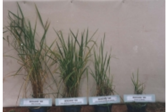
‘Inoculum dependence’: gradation of RYMV symptoms from uninoculated (left) through spot-inoculated and single-leaf inoculated, to fully inoculated plants of Bouaké 189

Once we know where the virus spends the off-season, the next question is: how is it transmitted? “The essential aspect of the epidemiology of RYMV,” explains Séré, “is the role of mechanical injury of plants—any mechanical injury in the presence of virus particles.” In addition to root damage during transplanting, rice plants are especially prone to damage during weeding operations when farmers use hoes—if an infected rice plant is damaged during weeding, virus is deposited on the hoe. If a healthy plant is then damaged with the same hoe, the virus is immediately available to enter via the fresh wound. The virus can