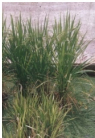
The panicles of infected plants (left) do not exert properly

Healthy (background) and RYMV-infected (foreground) rice. Note the paleness of the leaves (chlorosis) and short stature of the plants (stunting)